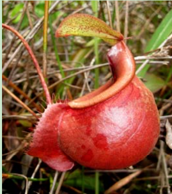
N. mirabilis var. globosa

January of 2013 started off with a huge success, which we hope we will be able to capitalize upon in the future... SEANSRF partners were informed late in 2012 that the last known 100% genetically pure colony of N. mirabilis var. globosa was about to be destroyed in the development of an oil palm plantation!