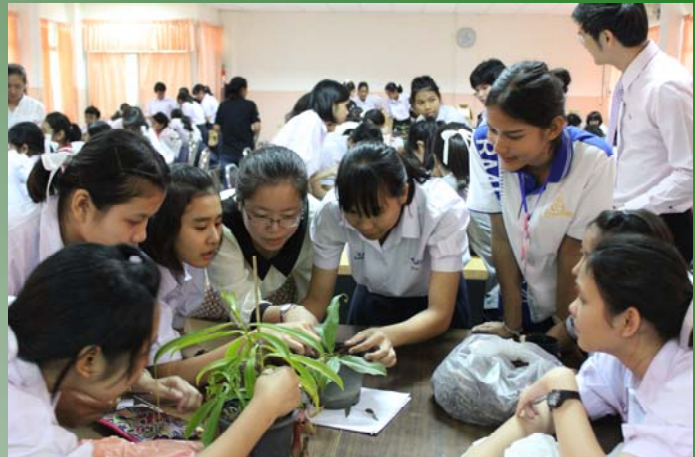
Project-based learning Camp